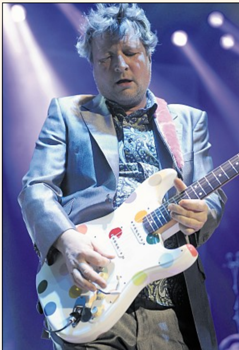
COOL: Squeeze were on top form at The Music Hall.